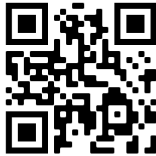
La ola del lago video