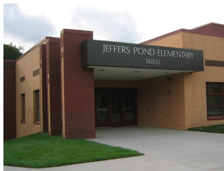
Jeffers Pond Elementary

8100 157th Street, Savage 952-461-7800 • 9:20 a.m.-3:50 p.m.