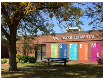
Five Hawks Elementary

16620 Five Hawks Avenue SE, Prior Lake 952-226-0100 • 8:30 a.m.-3:00 p.m.