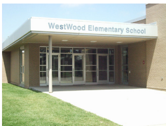
WestWood Elementary & SAGE Academy

15200 Hampshire Avenue, Savage 952-226-8000 • 8:30 a.m.-3:00 p.m.