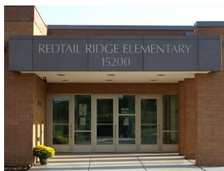
Redtail Ridge Elementary

5061 Minnesota Street SE, Prior Lake 952-226-0300 • 9:20 a.m.-3:50 p.m.