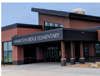
Hamilton Ridge Elementary

6601 Connelly Parkway, Savage 952-226-0200 • 9:20 a.m.-3:50 p.m.