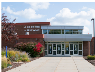
La ola del lago at Grainwood

14800 Jeffers Pass NW, Prior Lake 952-226-0600 • 9:20 a.m.-3:50 p.m.