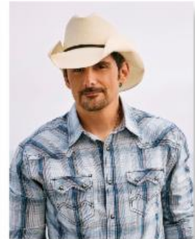
Brad Paisley, headliner July 13