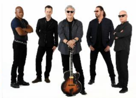
Steve Miller Band, headliner July 12